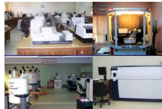
Leading-edge Research Facilities at the ICCBS