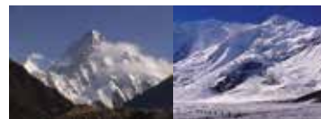
The Fantastic Mountains of Pakistan