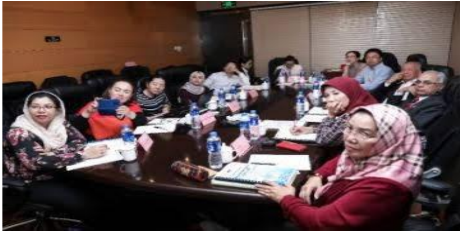
Group Meeting in Beijing