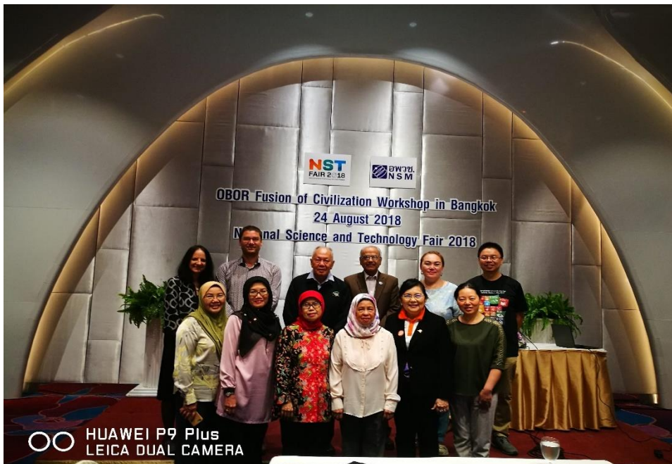
Group in Bangkok Meeting