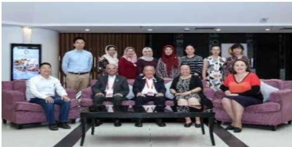
Group in Beijing