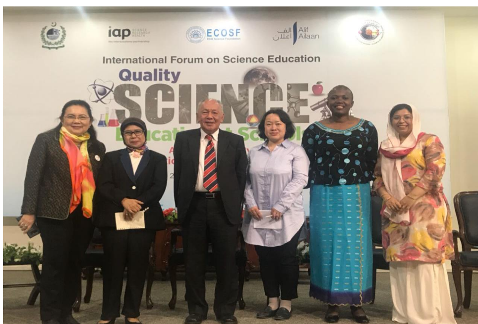
IBSE Panel Session in Islamabad