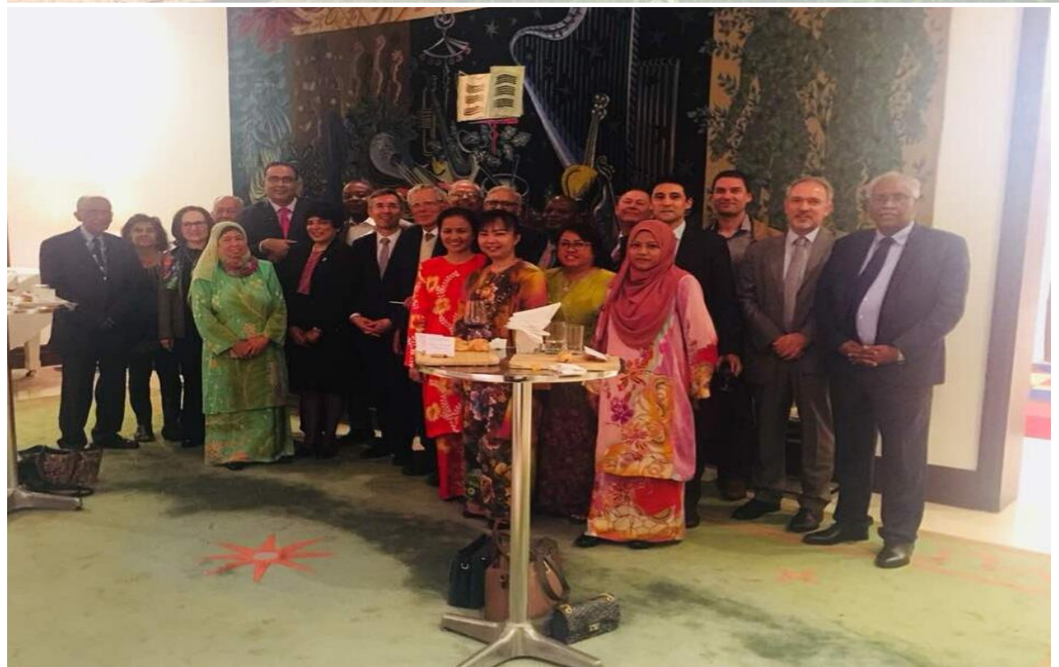
Reception by HE French Ambassador to Malaysia at his Residence