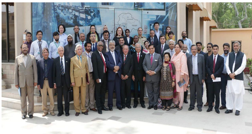
Group Photo of Science Education Forum in Islamabad