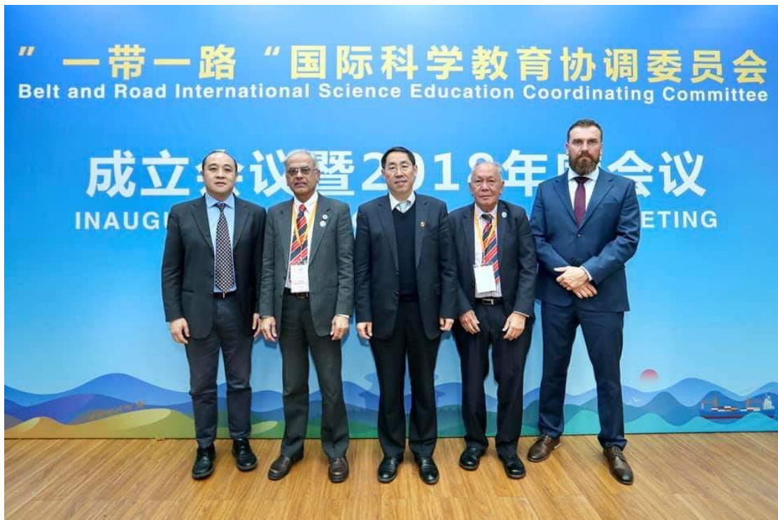
The President and Vice Presidents of the CAST Belt and Road Science Education Coordinating Committee