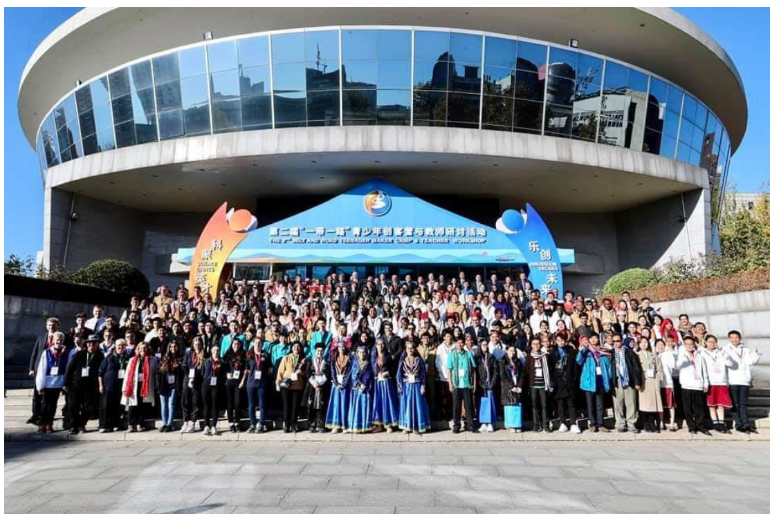
The second Belt and Road Teenager Maker Camp and Teacher Forum with 250 participants from 29 countries.