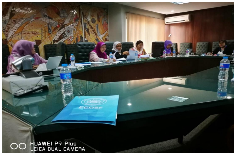
Group Meeting in Islamabad