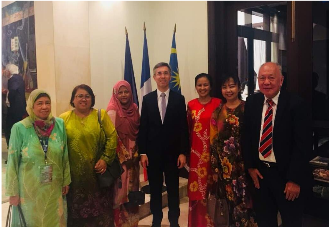
HE French Ambassador to Malaysia with Four Malaysian Primary Science Teachers who went to Paris on Malaysia France Primary Science Exchange Program 2017-2018