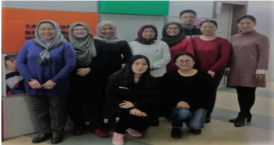
Editing Sub Group in Nanjing